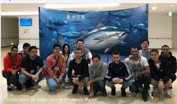
Toyosu Fish Market

Cooperation by Tokyo Central Wholesale Market