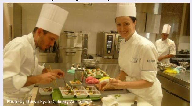
Practical Culinary Training in Culinary School (Final Exam)