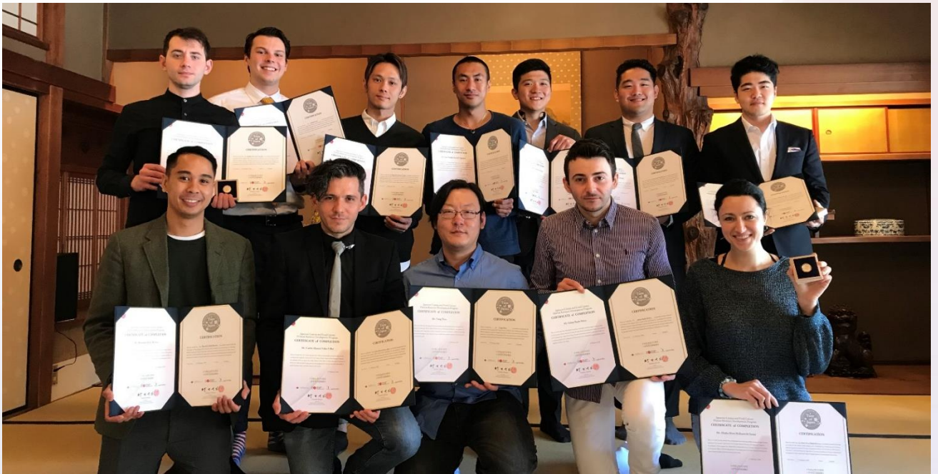
Certificate of the Program