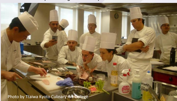
Practical Culinary Training in Culinary School